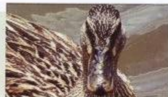
TRUE MALLARD FEMALE: Look for the lighter eyebrow stripe and dark stripe along the eyes.