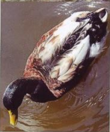
HYBRID MALLARDS: White quackers and ducks with orange-coloured feet are defined as Mallard hybrids.