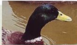
TRUE MALLARD MALE: Green head, yellow bill and white collar, just above the chest.