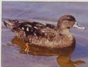
African Black Duck

Never mistake the Mallard for the following indigenous ducks: